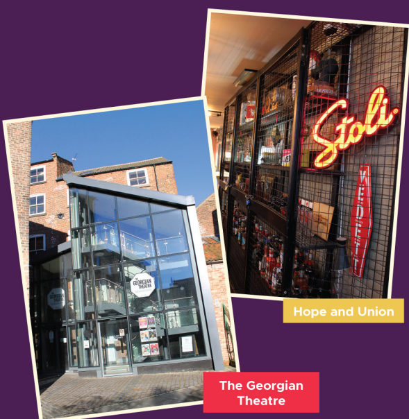
Hope and Union

Stockton BID hope you have a great night out here in Stockton-on-Tees.