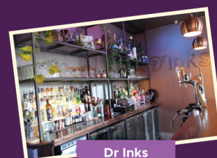
Dr Inks Cocktail Bar